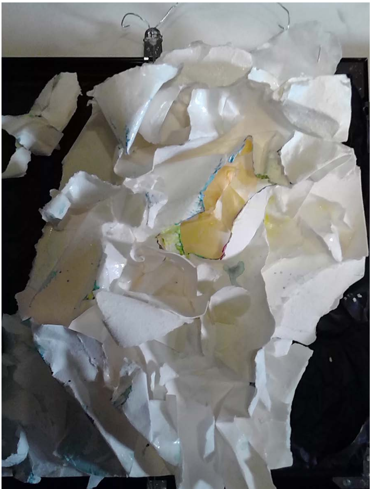
Olga Shmuylovich, Reintegration. Mixed medium. 5