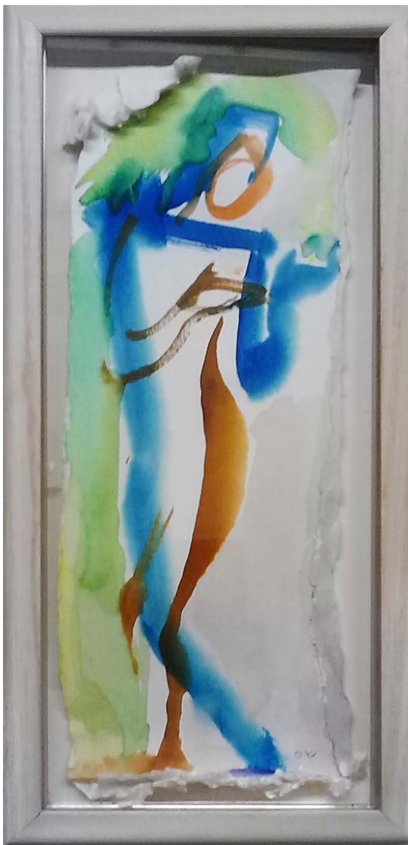
Olga Shmuylovich, Reintegration. Mixed medium. 1