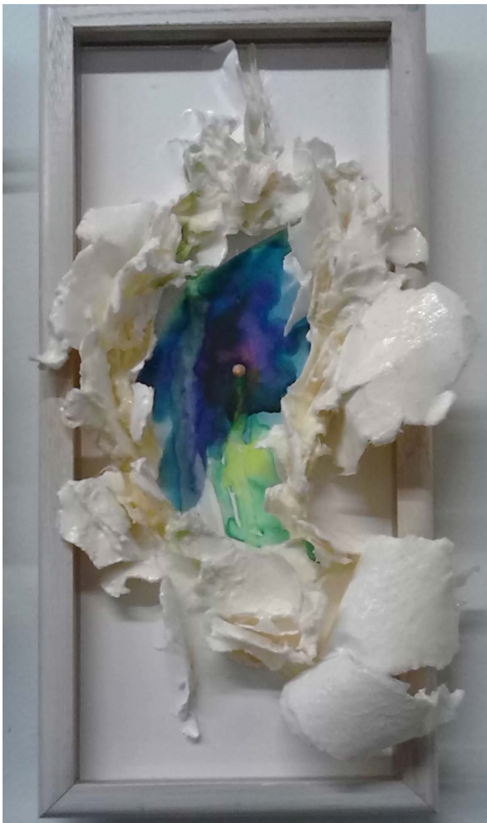
Olga Shmuylovich, Reintegration. Mixed medium. 6