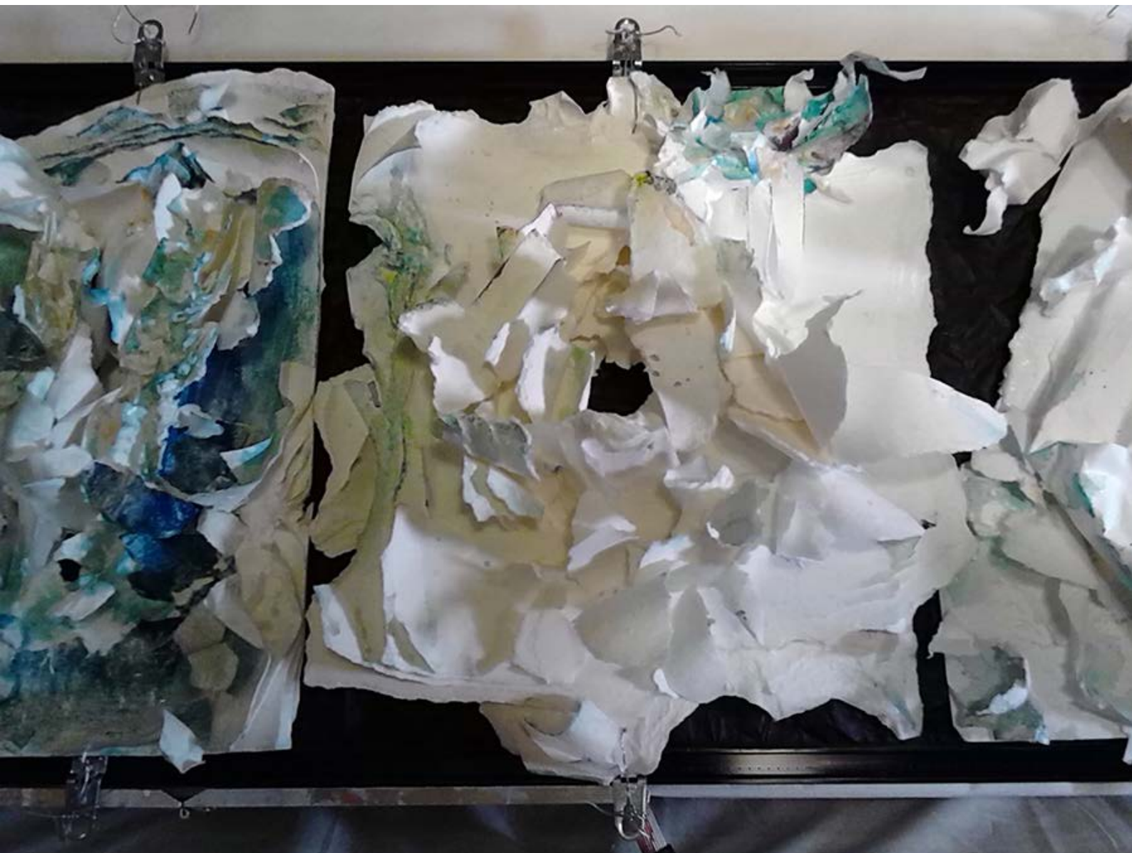
Olga Shmuylovich, Reintegration. Mixed medium. 4