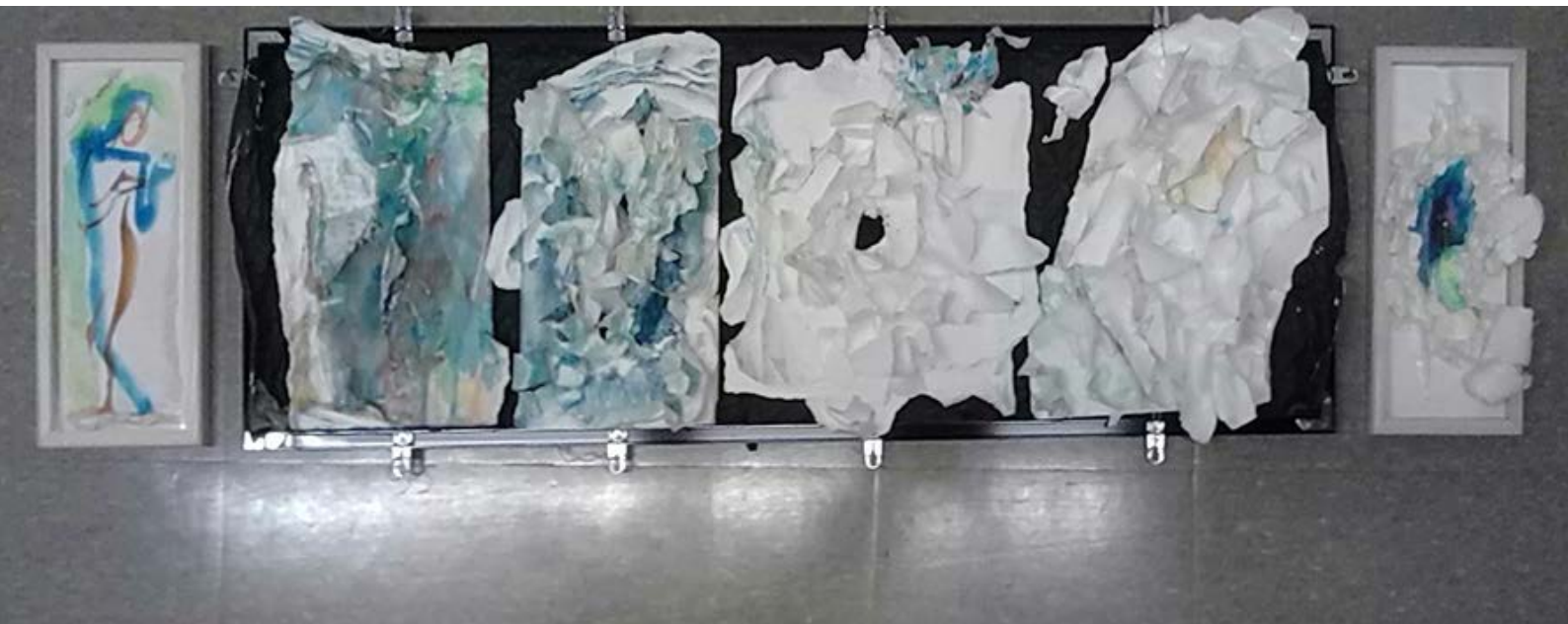
Olga Shmuylovich, Reintegration. Mixed medium. Full view

* “Substance Agents” – agents formatting, shaping ever changing entities of existence. After N.O. Losskiy