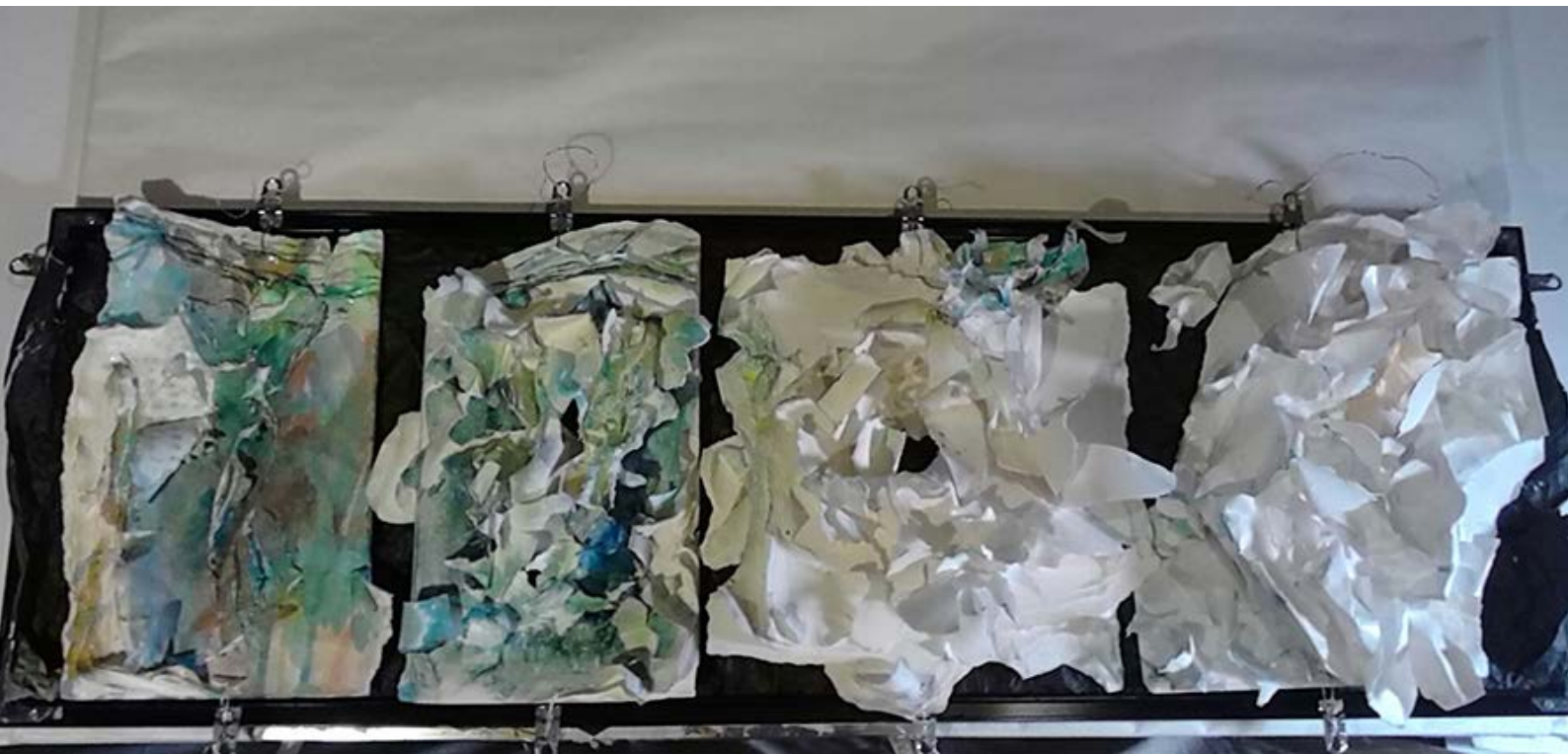
Olga Shmuylovich, Reintegration. Mixed medium. 2, 3, 4, 5